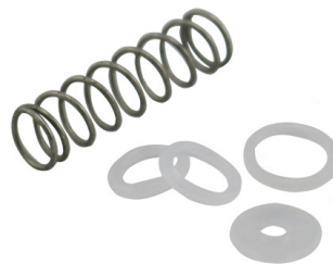
RHSPVSK-01 Spinjet Valve Gasket Kit