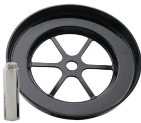
RHBRM Blender Rinsers Kit